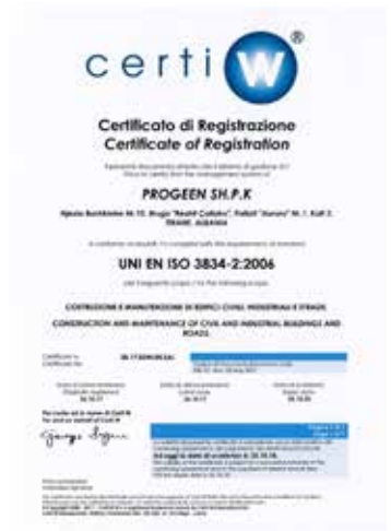
UNI EN ISO 3834-2:2006